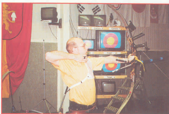
Left, above & right: Taking full advantage of the equipment.