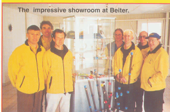
The impressive showroom at Beiter.